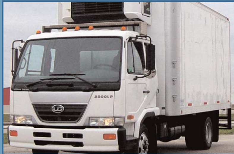
*UD2300LP shown here with dealer installed optional equipment.