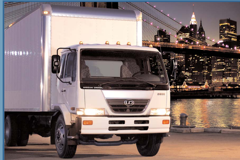
*UD2600 shown here with dealer installed optional equipment.